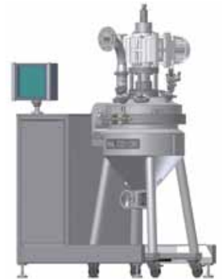
High-end design of CD