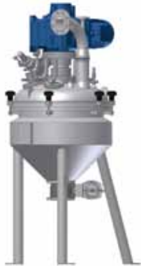
Basic design of CD

Mixing and heating at the same time – the process performed in the Conical Dryer for humid solids. If the vessel is designed acc. to GMP, the cover of the standard version is equipped with a tilting device or the complete plant is given a frame with slewing mechanism for the complete vessel and integrated electric control, the plant can be used for many other fields of application. The improved and cost favourable design of the IKA® Conical Dryer enables the execution of the plant that is required for your application.